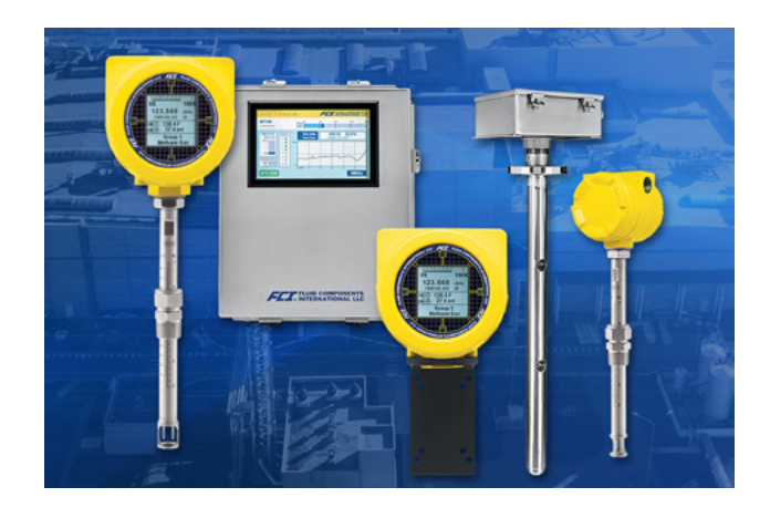
Figure 3: FCI Model ST100, ST102 and MT100 flow meters

These applications are often difficult for other flow meter technologies because of distorted flow profiles associated with inadequate straight-run and larger cross-sectional measurement areas, which can lead to inaccurate flow readings when using a single point meter design. The use of multiple sensors addresses this by breaking a large cross-section down into smaller measurement areas and averaging them to provide a more accurate reading.